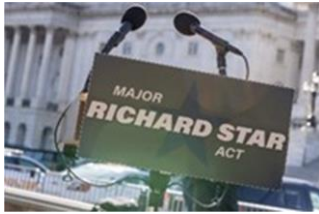
Priority for funding