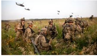
Reinstated Policy has impact