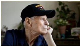
Making new connections